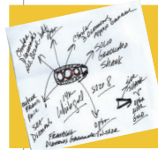
Diamond Stacking Ring

“THE BOTTOM LINE IS MAKING MY GUEST VERY HAPPY AND I AM THE MAN TO DESIGN IT AFFORDABLY WITH LONG LASTING QUALITY.”