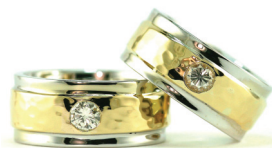
Sovereign Solitaire Diamond Rings