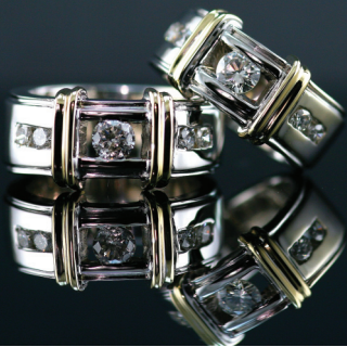
Finished Diamonds two-tone 14K Gold Wedding Rings

I was working as an apparel designer/merchandiser on 7th Ave in the garment center of New York City from 1977 to 1986. I worked for European import companies to increase their business dealings in the USA. My work consisted of traveling extensively to Italy, France and England for product development of fabrics and trends for the U.S. market. I continued to manufacture the clothing collections and work in Japan, India, Taiwan, Korea and Hong Kong. I was very fortunate that my talent in merchandising the fashion trends sold in major department stores, specialty boutiques and national chain stores. In 1986 I decided to leave the clothing industry taking the marketing knowledge I learned and the vision I naturally had to challenge the fine jewelry industry. My goal 1 was to create designs that are classic, timeless; innovative but most of all unique. I want all my pieces to reflect jewelry that are works of art.