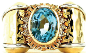
Regal Signet Ring